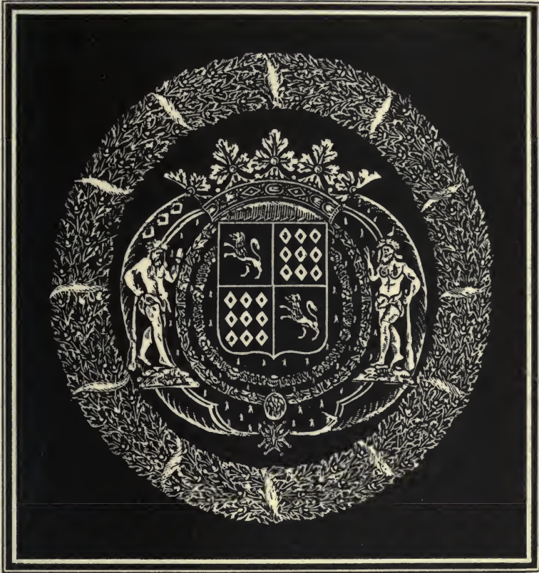
LE DUC DE LUYNES.